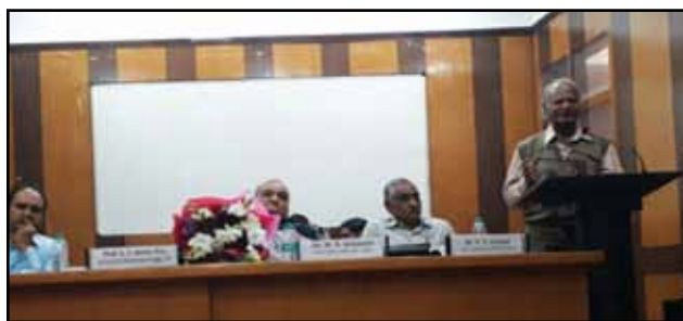
The Chief Guest addressing the audience during the Induction Meet