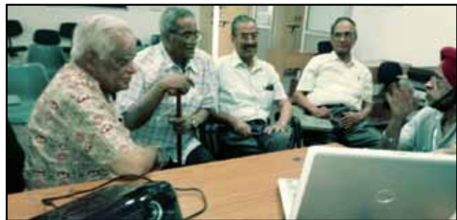
Interactive session after the Lecture