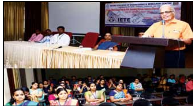
A five-day workshop organised by the Centre