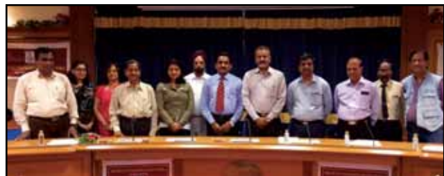
Attendees and dignitaries all celebrating WT&ISD at the Centre