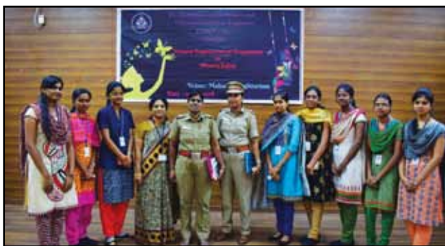
Participants of Programme on “Women Safety”