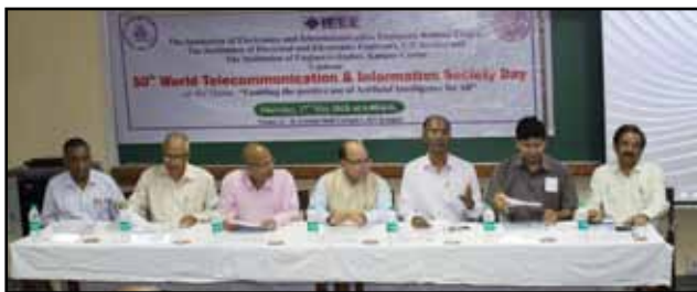
Dignitaries on the dais during WT&ISD celebration at the Kanpur Centre