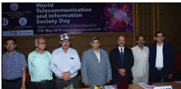
50 th WT&ISD - 2018 celebrated at the Centre