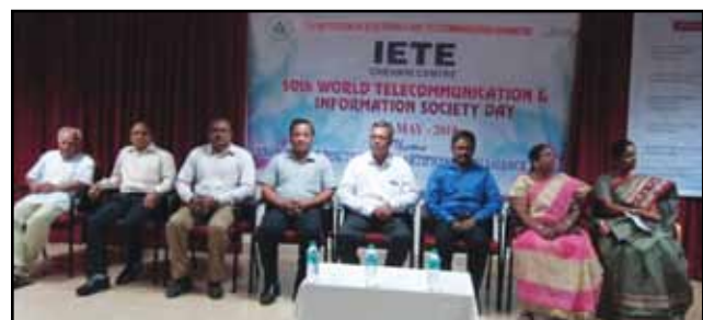
Dignitaries on the dais during WT&ISD celebration