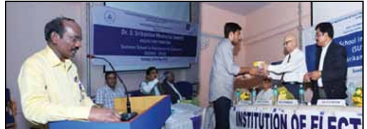
Summer School in Electronics & Computers -2018 held at IETE Bangalore Centre