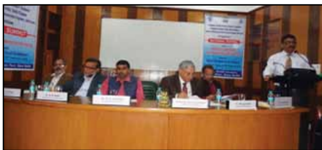
National Seminar on Digital Judiciary – Technologies for Justice, in progress