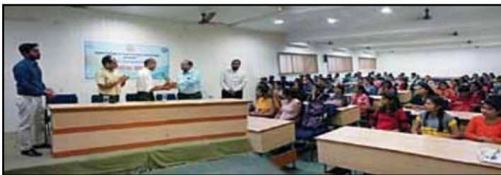
Seminar on “ Branding, Digital Marketing and Latest Trends in Industry ” in progress