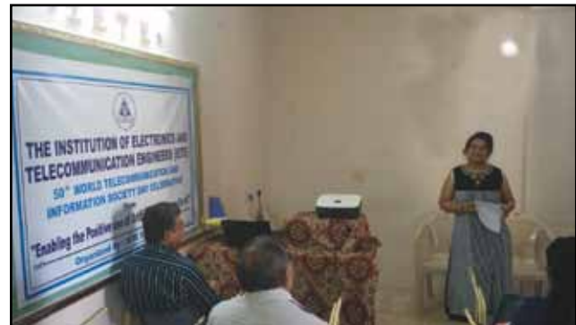
50 th WTISD celebrated at IETE Rajkot Centre