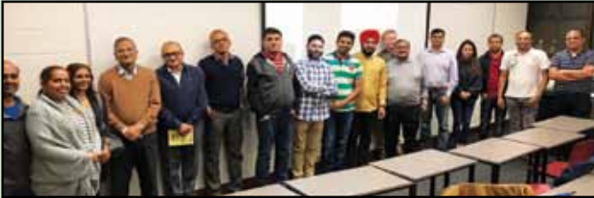
Participants during 9 th IETE Australia Symposium at Murdoch University