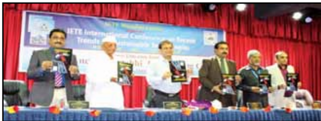
Release of Souvenir during ICRTST-2018