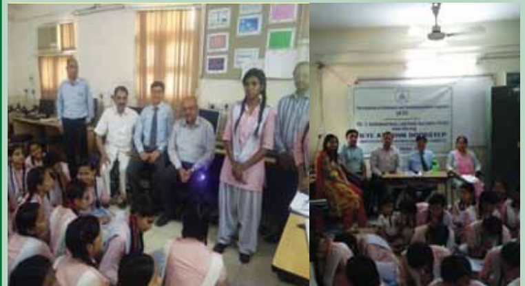
Workshop on “Computer Awareness Programme” for Girl Students conducted by IETE HQ