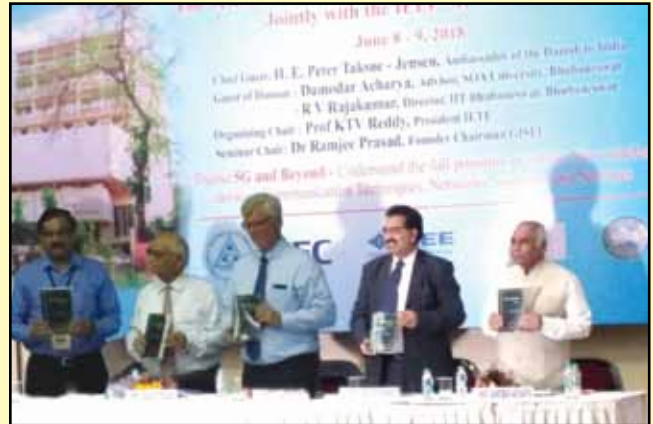
Dignitaries releasing the Book