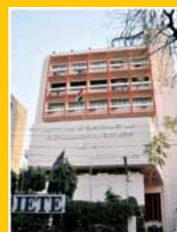
IETE HQs, New Delhi