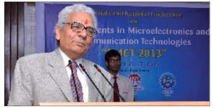
President, IETE addressing the audience

The conference was successful in its efforts to increase awareness and knowledge among scientists, researchers and students about education and research being carried out in India in the areas of Micro Electro Mechanical Systems (MEMS) and NANO Engineering.