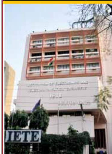
IETE HQs, New Delhi