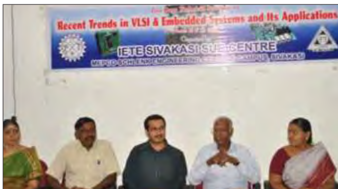
Technical Seminar on Recent Trends in VLSI & Embedded Systems and its applications, in progress