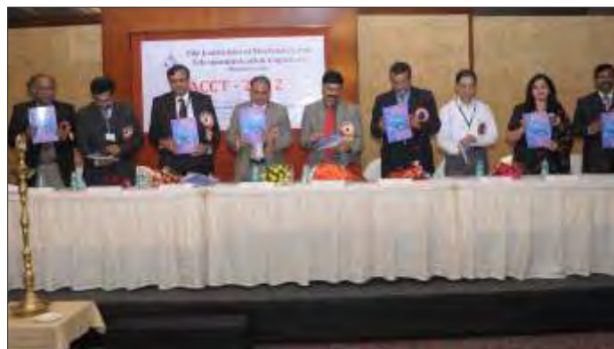
Release of Souvenir