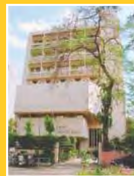
IETE HQs, New Delhi