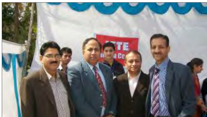
A section of delegates during Samillan 2012, Kot Bhalwal