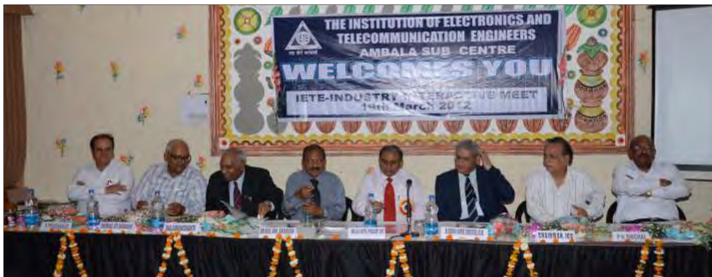
A panel of experts during IETE Industry Interactive Meet