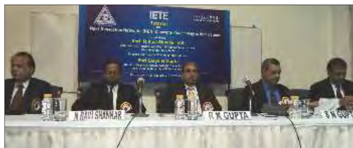
Inaugural session of Tutorial on NGN Concepts

emerge; PSTN networks would likely to continue offering voice telephony services for a while; State-of-the-art PSTN solutions of today could evolve and stay part of the future NGN Ecosystem through MGs to preserve legacy investments (Co-existence) and Access modernization (Next Generation Access) was the key for the introduction of advance Converged services and new quad-play Services and Applications (data, voice, video and mobile) over the same network.