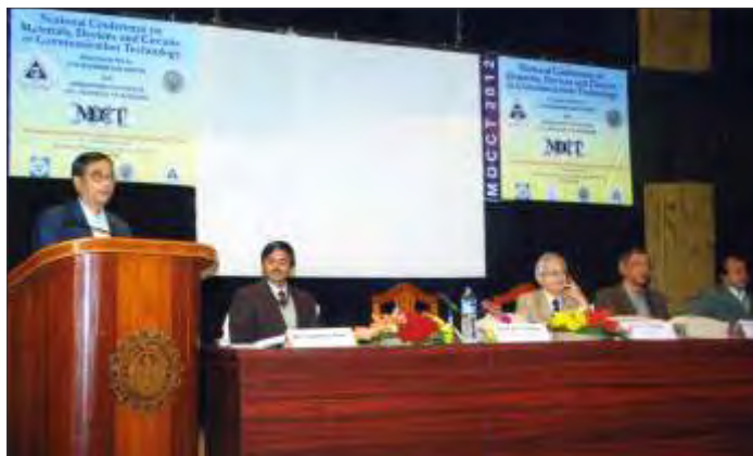
National Conference on “Materials, Devices and Circuits in Communication Technology 2012” in progress

A National Conference on “ Materials, Devices and Circuits in Communication Technology-2012 (MDCCT 2012) ”, was jointly organized by the IETE Burdwan Centre and Dept of Physics, University of Burdwan, WB, on 6 th -7 th Feb 2012. This was the 2 nd conference in the series dedicated to Acharya P C Ray, commemorating his 150 th birth anniversary. There were about 62 contributed papers accepted for publication in the proceedings. The Conference was inaugurated by Dr