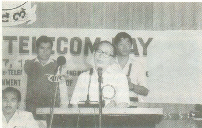
Shri Rishang Keishing, CM Manipur, delivering the Inaugural speech during World Telecom Day Celebrations, Imphal

Hony Secretary, IE(I) Kanpur gave the vote of thanks.