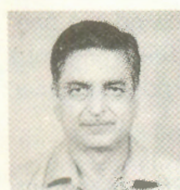
Maj Gen Yashwant Deva, AVSM (Retd) , A freelance writer.