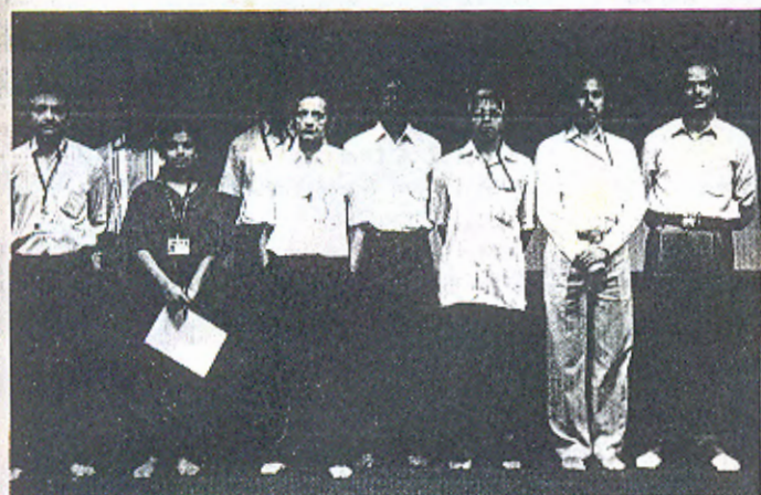
Workshop on "PIC Microcontrollers" at IETE Coimbatore sub-centre, 20-30 May 2006.