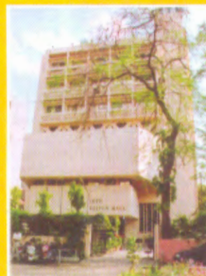
IETE HQs, New Delhi

Newly Elected Office Bearers of IETE Centres/ Sub-Centres (2010-12)