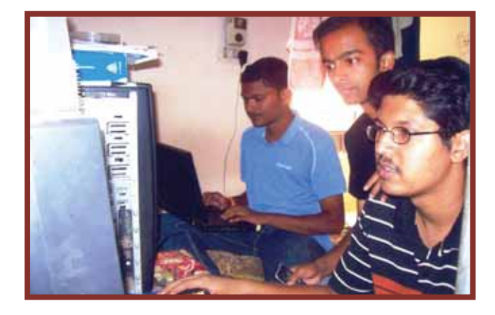
Participants of "NOESIS"- the online quiz.