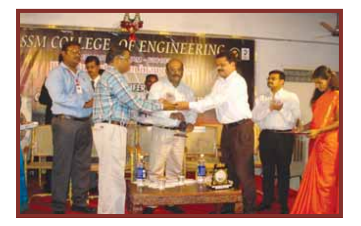
Conference & Inauguration of ISF at SSM College of Engineering, Komarapalayam, Coimbatore.

ISF at Kalaignar Karunanidhi Institute of Tech, Coimbatore, inaugurated on March 17, 2009.