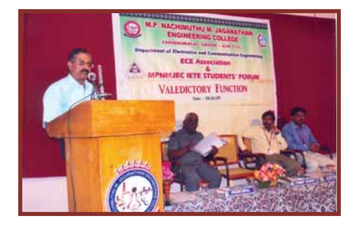
Association Valedictory Function, ISF MPNMJ Engg. College, Chennimalai, Erode, on Apr 4, 2009.

Activity at ISF Vadakkenchery College of Applied Sciences, Palakkad, in March 09.