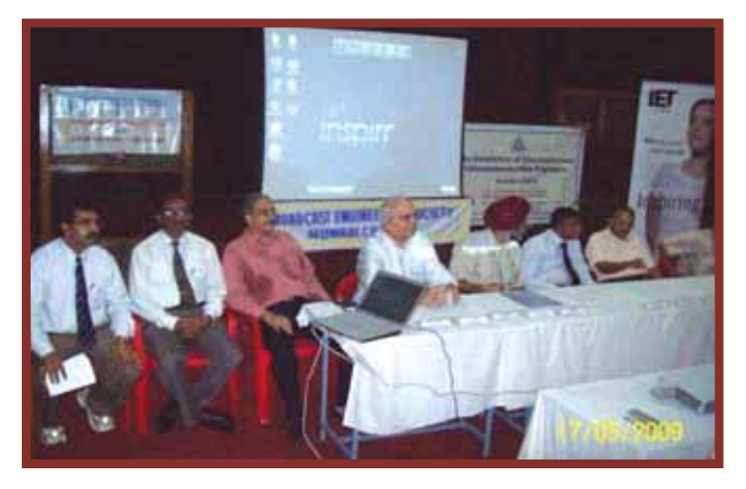
A view during discussions on "Protecting Children in Cyberspace" at IETE Mumbai Centre.