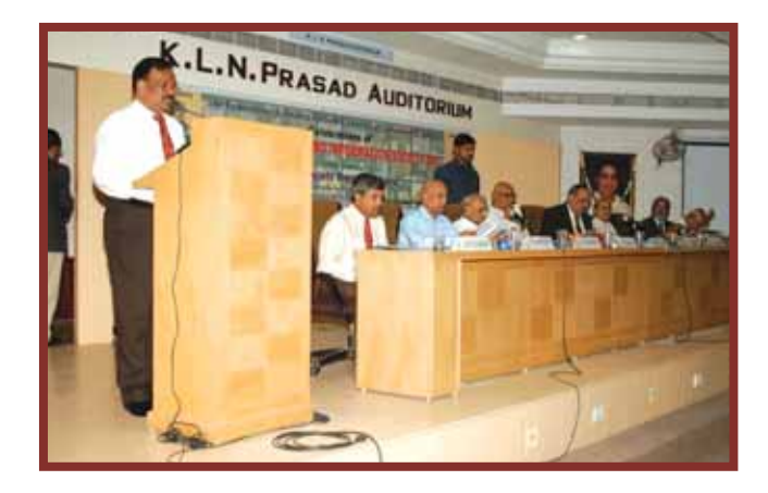
Dignitaries on the dais for 41<sup>st</sup> WTISD-2009 at Hyderabad Centre.