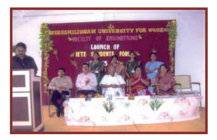
Inauguration of ISF in Avinashilingam University for Women, Coimbatore, on March 25, 2009.