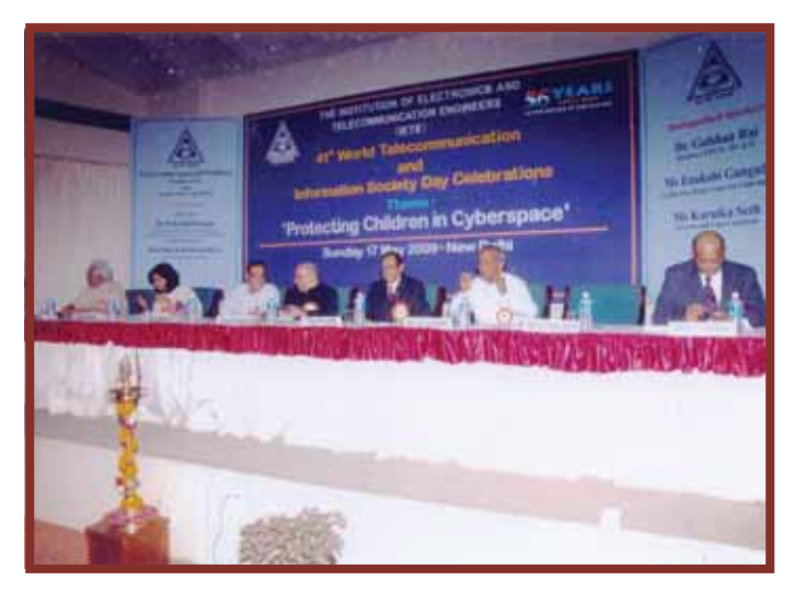
A view of dais during WTISD-2009 at IETE, HQs New Delhi

The event highlighted the kind of attacks children were exposed to with advances in the technologies and showcased useful sites giving tips on cyber ethics created especially for cyber crime dilemmas.