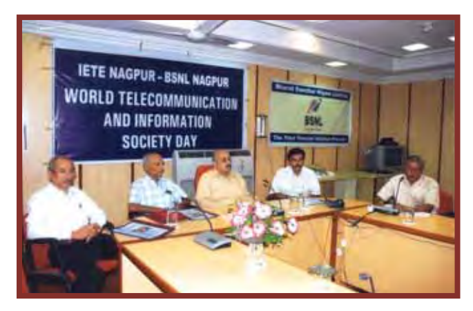
World Telecom Day 2009 at IETE Nagpur Centre.