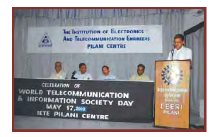
Dignitaries on World Telecom Day at IETE Pilani Centre.