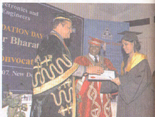
Award of Degrees.

education". According to him it was utmost necessary to correlate the social relevance with acquired knowledge. "Getting degree was not the end of education but was indeed a license for further learning", he said. Teachers & students taking full responsibility was essential for development and progress of the nation in Bharat Nirman. He advised every learner to discard individual prejudices and use their skills and knowledge for the benefit of the society. He advocated the role and importance of ICT in enhancing the quality & reach of education. Applauding IETE's focus on relevant subjects and areas like e-learning, distant education through EDUSAT, education for visually handicapped students, he said that IETE's role in carrying forward the socially relevant and technology sentient agenda of national reconstruction was praiseworthy. President IETE, presented a shawl and a memento to the Chief Guest. Thereafter the Convocation