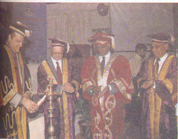
Lighting of Ceremonial Lamp.