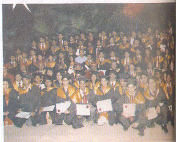
Group photograph AMIETE students.