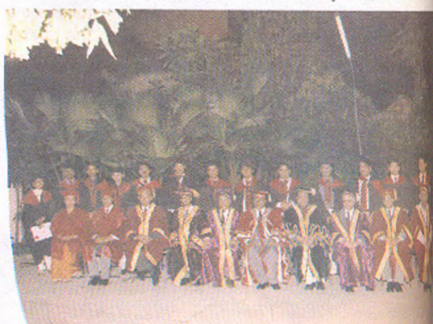
Group photograph ALCCS students.