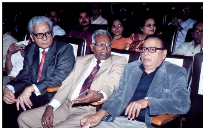
A view of distinguished guests during IETE Convocation.