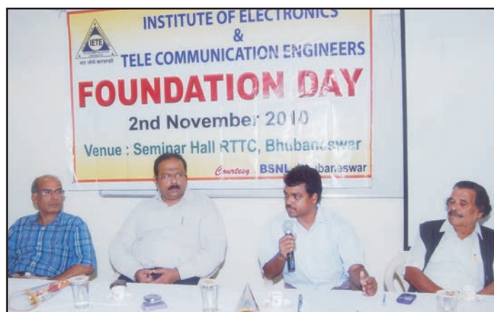
IETE Foundation Day Celebration at Bhubaneswar Centre

competitions were also conducted as part of the celebrations and the winners were awarded cash prizes and certificates.