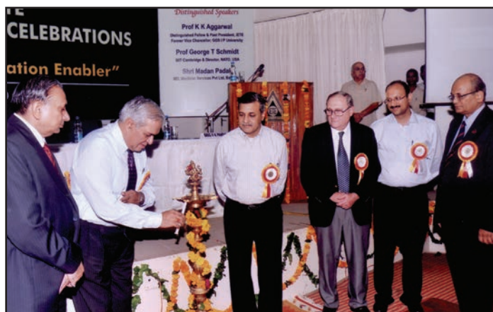
Dignitaries lighting the ceremonial lamp