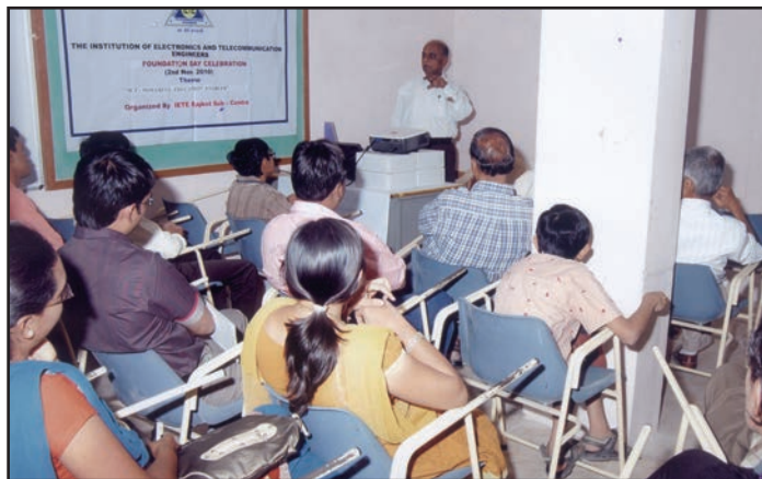
Quiz Competition in progress