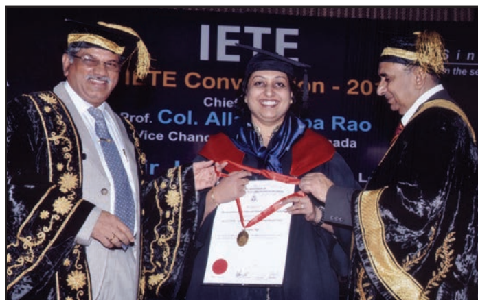
With pride ALCCS Degree recipient