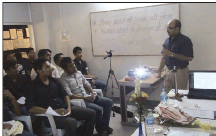
Technical lecture in progress