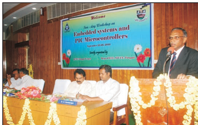
Workshop on "Embedded Systems & PIC Controllers" at Tirupati