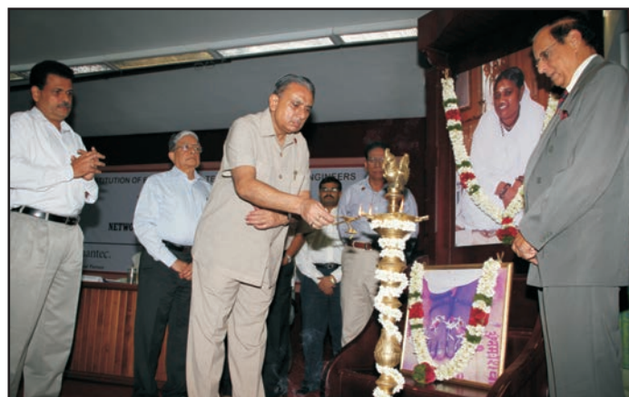
Lighting of ceremonial lamp and invoking blessings