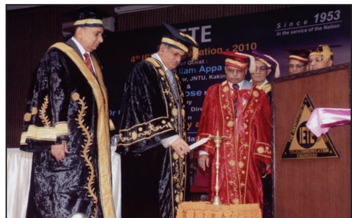
The Chief Guest lighting the ceremonial lamp

students marched into Mekaster Auditorium in a very dignified manner and systematically occupied their