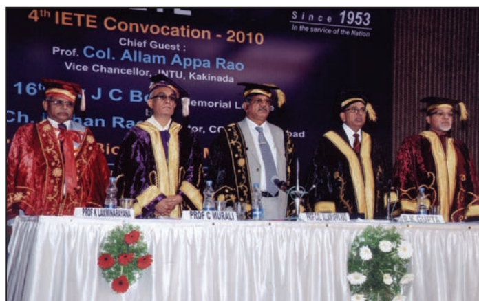
Dignitaries on dais for Convocation Ceremony