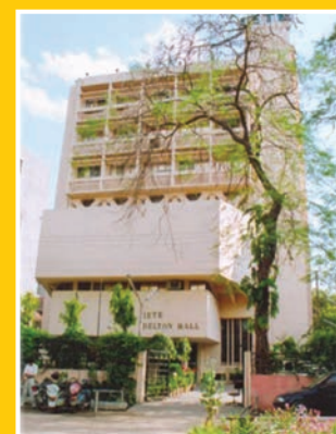
IETE HQs, New Delhi