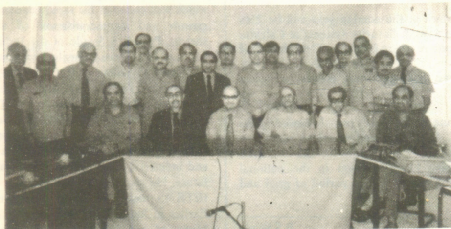
The President and members of the council, with chairman of local and subcentres at Hyderabad during the 40th Anniversary Celebrations.