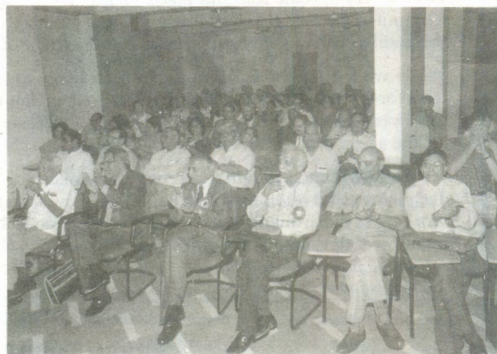
A view of the audience at the 42nd Annual Technical Convention