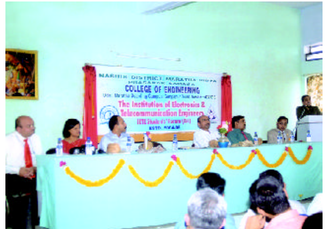
ISF function at IETE Nashik Centre.