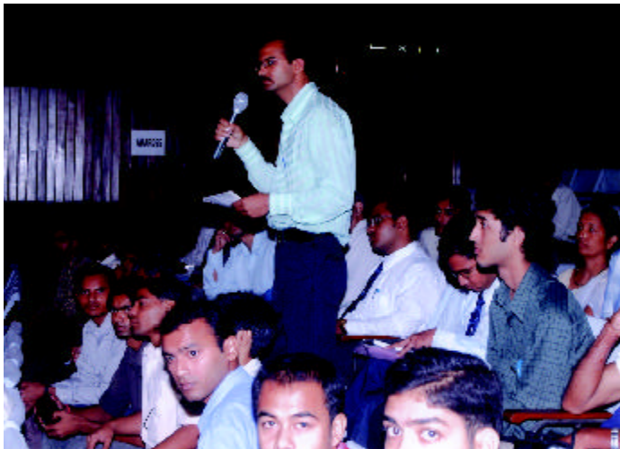
A Students' representative presenting his point of view during Students' Session.