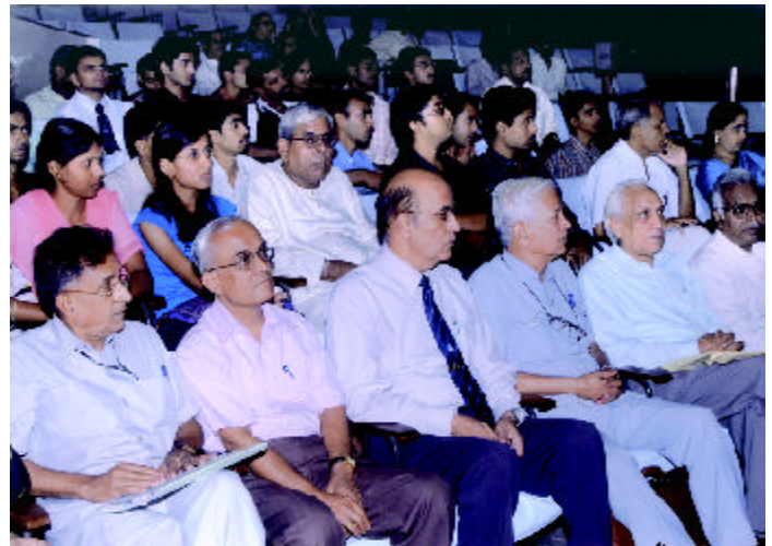
A section of audience of students and council members during Students' Session.