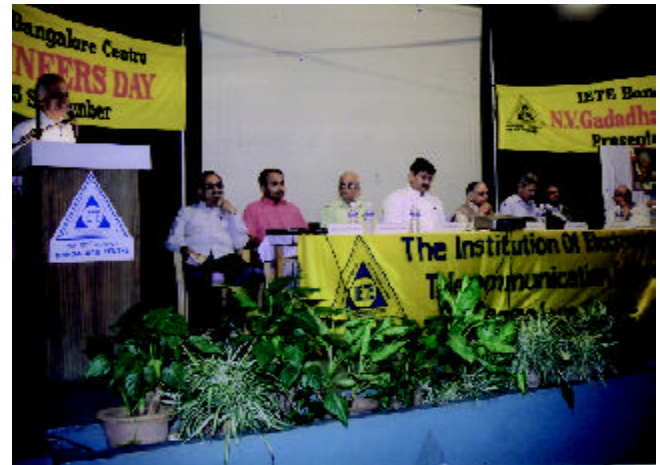
IETE Bangalore Centre, celebrating Engineers' Day.