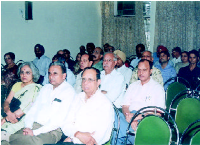
A view of the audience at IETE Noida Centre, during technical lecture on "DTH in India."