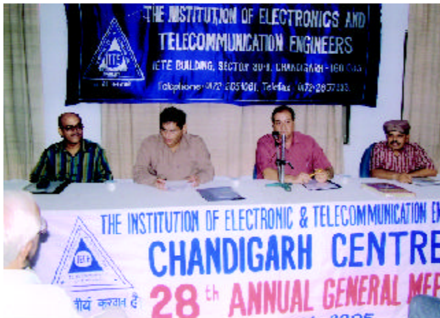
Annual General Meeting in progress at IETE Chandigarh Centre.