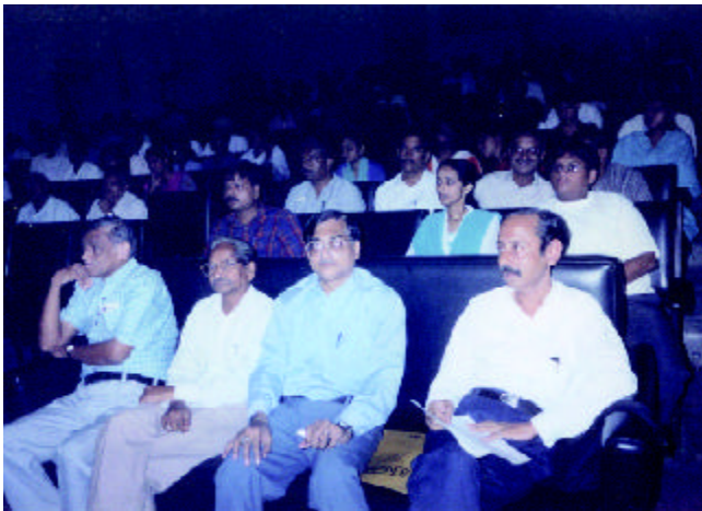
Engineers' Day celebration at IETE Allahabad Centre on Sept 15, 2005.