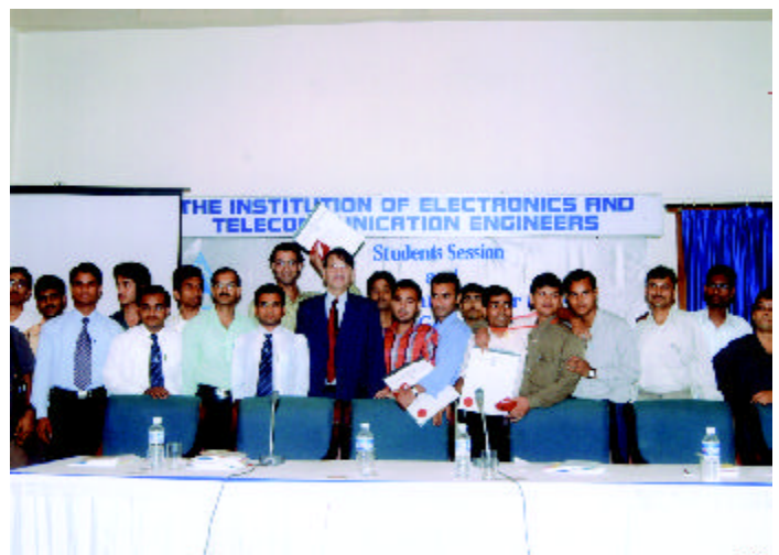
Academic Awardees with President IETE.