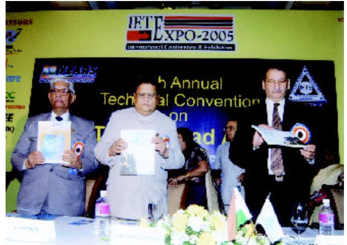
Chief Guest, Hon'ble Minister Shri Sontosh Mohan Dev releasing souvenir and special issue of IETE Technical Review during 48 th ATC on Sept 23, 2005.