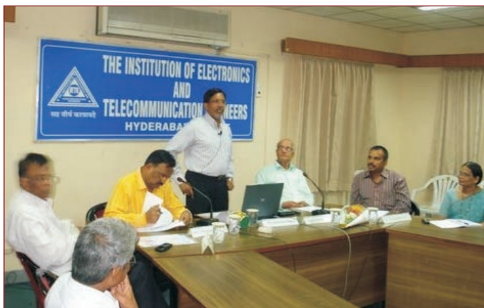
Short term course held at IETE Hyderabad Centre.