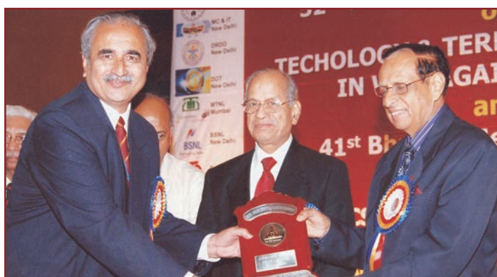
2 nd Best Centre Award-IETE Pune Centre

companies exhibited their impressive range of latest ICT systems and hardware. The exhibition received an overwhelming response.