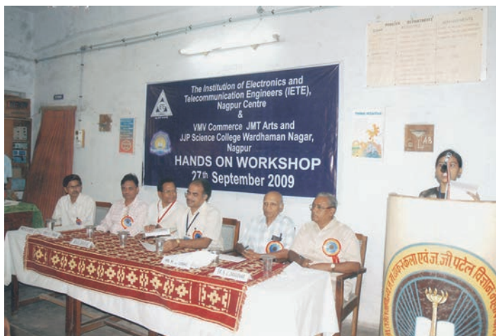
Hands on workshop in progress at IETE Nagpur Centre