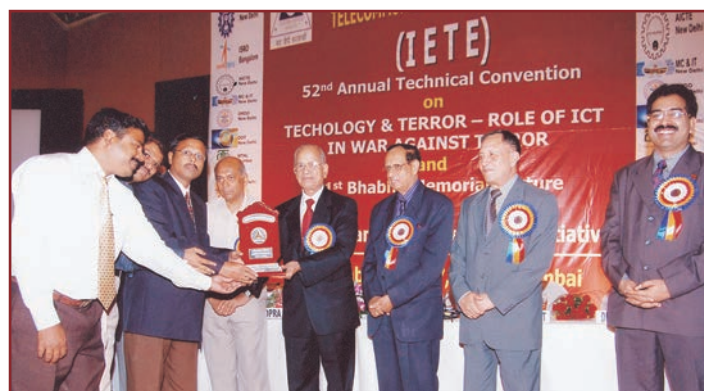
2 nd Best Sub-Centre Award-IETE Dharwad Sub-Centre