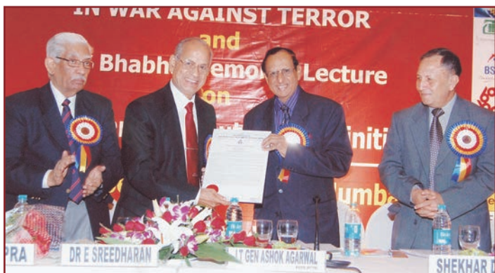
President IETE, presenting citation to the Chief Guest.