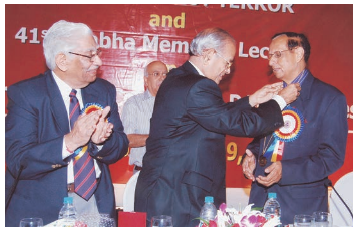
President IETE being re-installed for the year (2009-10)