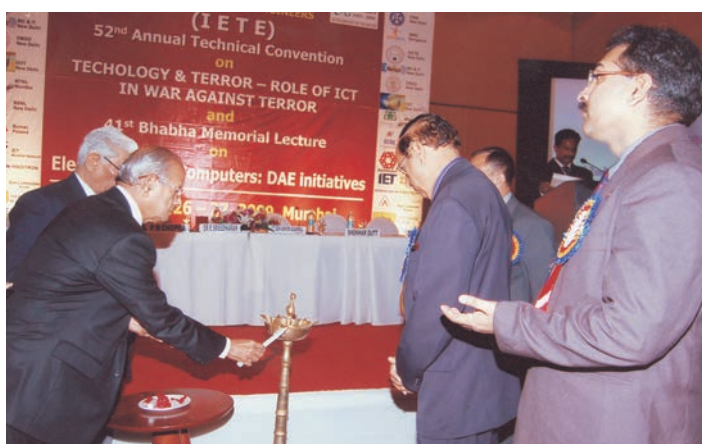
The Chief Guest Dr E Sreedharan , MD, DMRC, New Delhi, and dignitaries inaugurating the 52nd ATC of IETE