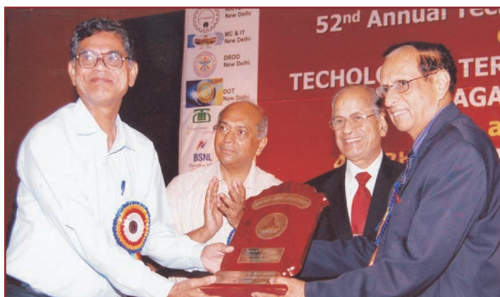
1 st Best Centre Award-IETE Bangalore Centre