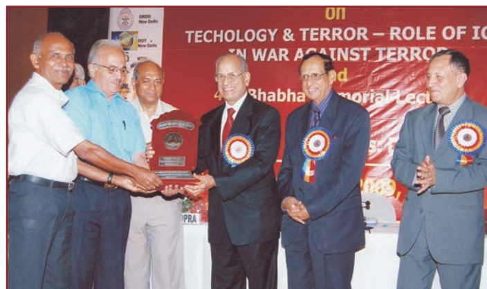
1 st Best Sub-Centre Award-IETE Palakkad Sub-Centre

The Chief Guest inaugurated the exhibition where