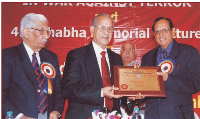
Conferment of Honorary Fellowship on Dr E Sreedharan.