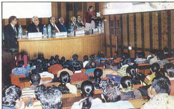
IETE Delhi Centre celebrating the Students' Day