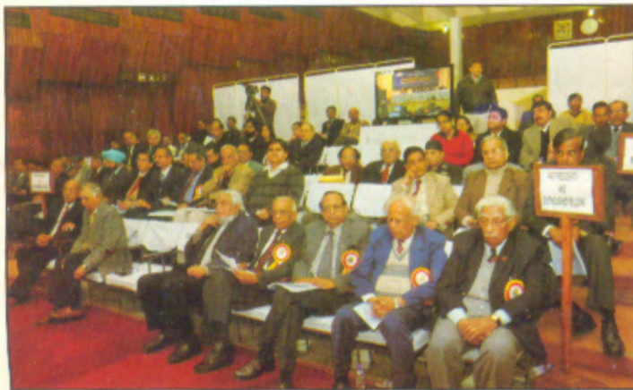
A section of audience