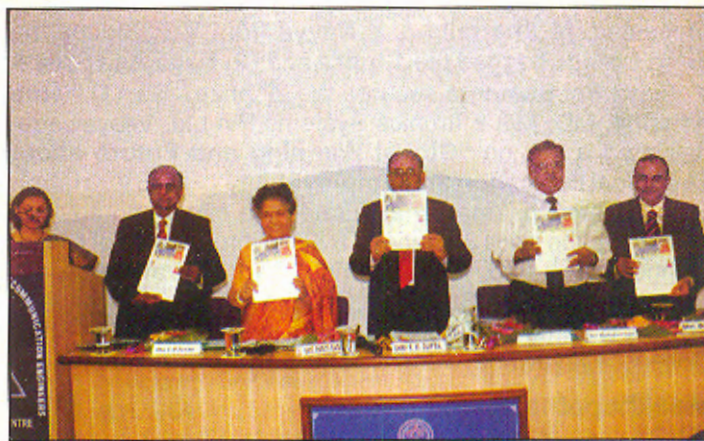
Release of the Newsletter during the Regional Seminar