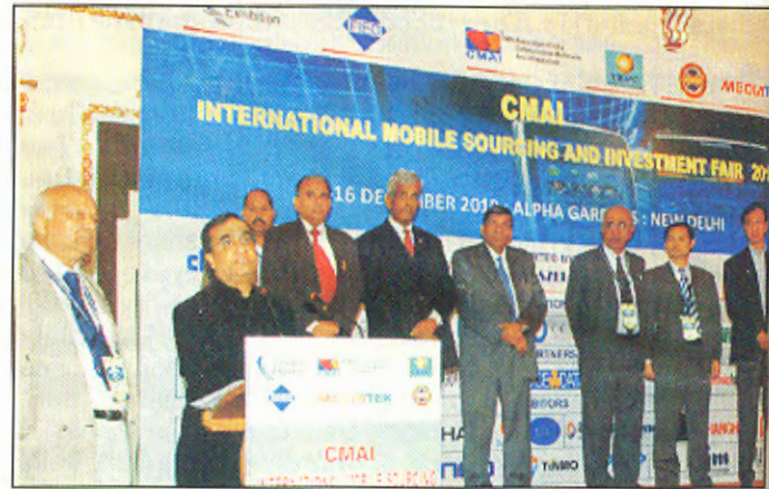
Dignitaries sharing the dais with the Chief Guest, Shri Ajay Maken, Hon'ble Union Minister of State for Home Affairs

without any change in next year for continued development this sector.