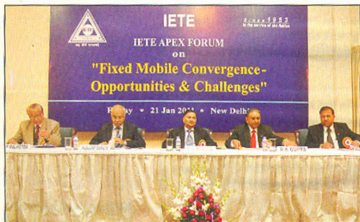
Inaugural Session of IETE Apex Forum

increase. Because of these exciting developments it is important to find ways to use these technologies effectively. Fixed - Mobile Convergence (FMC) an emerging technology promises seamless connectivity between fixed and wireless telecommunication networks regardless of locations, thus optimizing transmission of data, voice and video communications among end users irrespective of their locations or devices leading to efficient spectrum utilization, which has become a resource." He also mentioned the current high deployment, Interoperability, availability of Wi-Fi enabled dual mode handsets and regulatory issues, etc. as some of the crucial strategic issues for the deployment of FMC. The need for its deliberation in the Apex Forum.