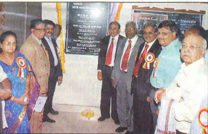
IETE President, JNTU Kakinada VC with other dignitaries at inauguration of 58 th IETE Centre