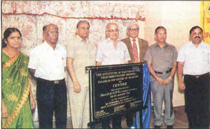
Upgradation of IETE Palakkad Sub-Centre to the status of Centre

Treasurer, proposed the vote of thanks. A special meeting was held of the Executive members from Kochi, Coimbatore and Palakkad, wherein valuable views, opinions, and suggestions were expressed. The Students' Session was held in the evening in which the President answered the students queries. He assured them of Council's decision on giving due attention to their problems. The function was covered by Media and TV Channels of Palakkad, AIR and Doordarshan.