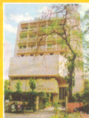
IETE HQs, New Delhi