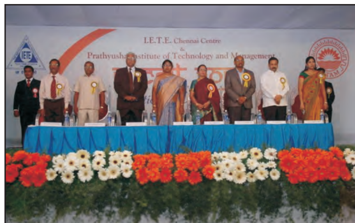
Dignitaries on the dais during RACEIT-2011 at Chennai