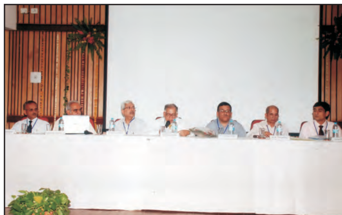
Seminar in progress

IETE Kanpur Centre organized a seminar on “ Sensors & Automation- Bringing Automation to Masses ” on 4 th April 2011 at IIT, Kanpur.