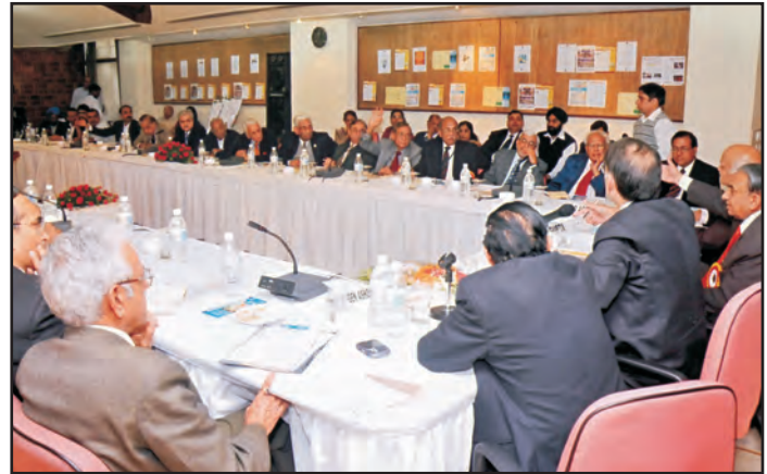
Discussion in progress