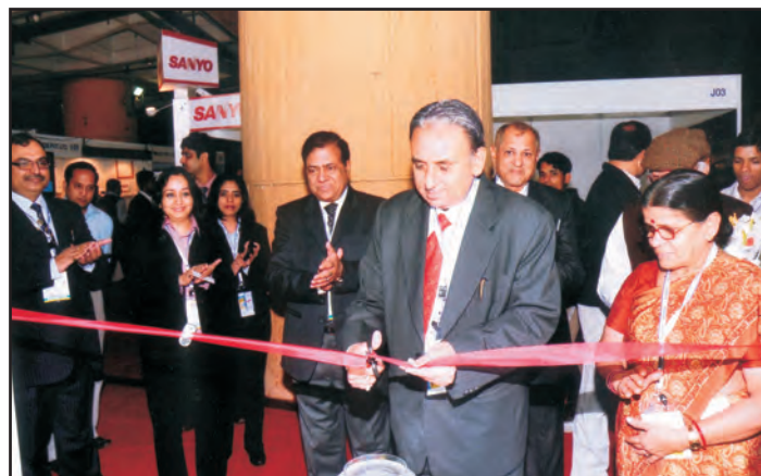
IETE stall being inaugurated in EFY Expo, Pragati Maidan

To spread the awareness about IETE activities amongst the potential masses, IETE HQ participated in the exhibition organized by Electronics For You (EFY) held at Pragati Maidan, during 17-19 Feb 2011. The main media used for publicity was the display of IETE's banners, posters and audio-video show on TV. The staff at the IETE stall, imparted counseling, distributed leaflets, folders, brochures on all the three days. The IETE stall was graced by the presence of President, Secretary General of the Institution and other esteemed members of IETE Governing Council. It was observed that amongst the large number of visitors, IETE stall attracted a good number of students fraternity. The exhibition increased the visibility of the Institution as budding engineers were delighted to know about IETE degree & diploma courses & the job opportunities offered by the Institution.