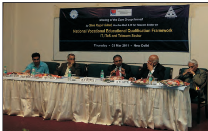
Joint meeting on National Vocational Education Qualification Framework