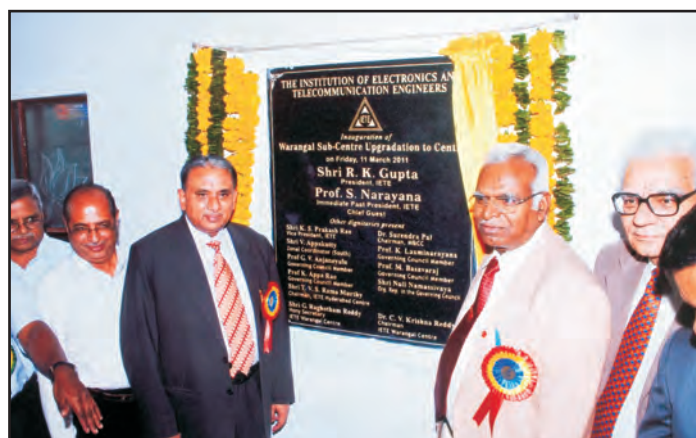
Upgradation of IETE Warangal Sub-Centre