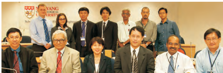
International Satellite Experts Speak for Workshop on Satellite Technology Friday, 25 March 2011