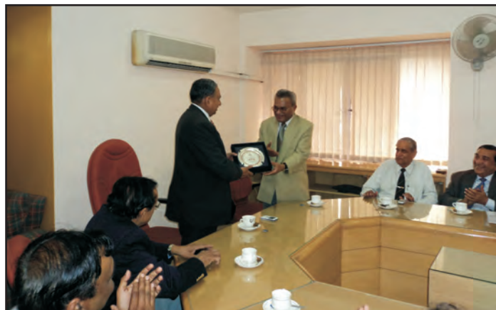
President IETE felicitating President IE at IETE Hqs