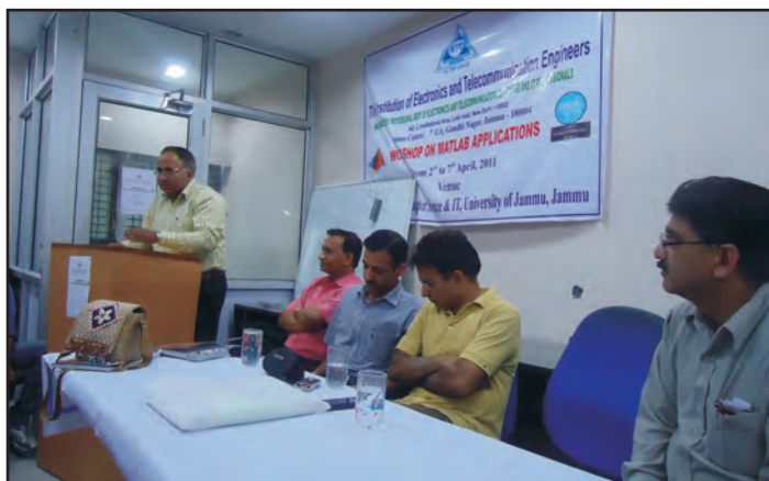
Workshop on MATLAB Applications

organized by the Centre during 2 nd -7 th April, 2011, supported by Compel Industry.