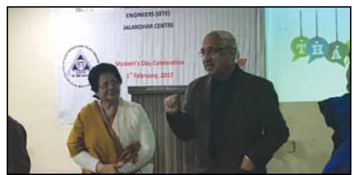
Dignitaries addressing the students

The Centre observed IETE Students' Day at DAV University on 1st Feb 2017. Activities included technical quiz contest, multi-media presentation and treasure hunt. Over 20 teams, comprising two members each participated. The event consisted of three rounds with varied difficulty, based on written, picture identification, rapid fire etc.