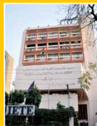
IETE HQs, New Delhi