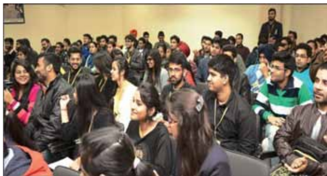
IETE Students' Day celebrated in association with ISF of Chandigarh Engineering College, Landran, Mohali