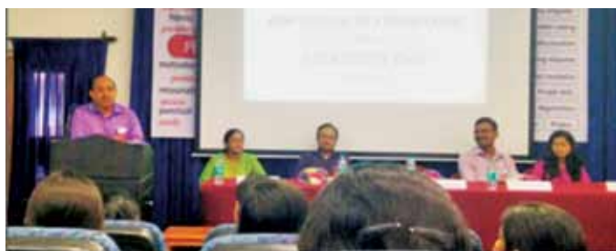
IETE Students' Day celebrated at IETE Sub-Centre, Goa