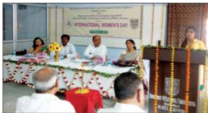
IETE Kanpur Centre celebrating International Women’s Day