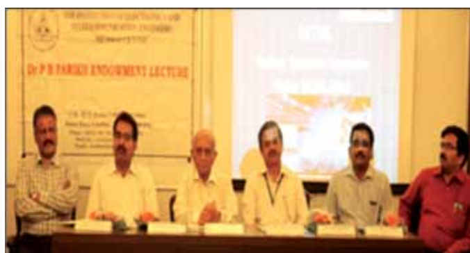
Dignitaries on the dais during Dr P B Parikh Endowment Lecture