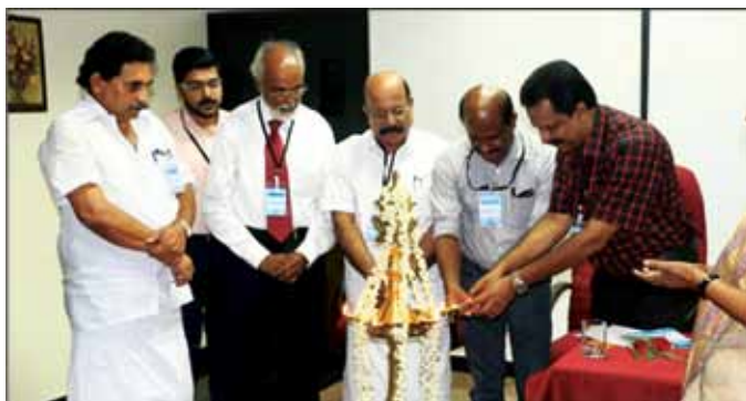
Dignitaries lighting the inaugural lamp