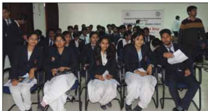
IETE Students’ Day at Lucknow Centre