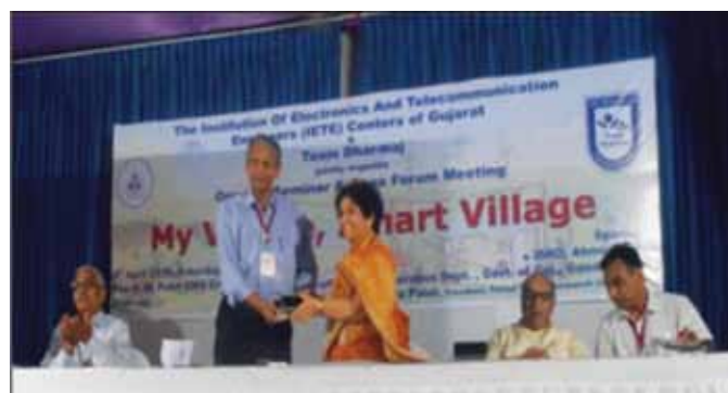
3 rd Apex Forum (2015-16) on the theme “My Village- Smart Village” in progress.

IETE Centres of Gujarat (Vadodara, Ahmedabad and Rajkot), Surat Sub-Centre and PAC at Sarigam together organized a one-day seminar & the 3 rd Apex Forum (2015-16) on the theme “ My Village- Smart Village ” at village Dharmaj, Dist. Anand, Gujarat on 2 nd April 2016, which also coincided with the silver jubilee year of IETE Vadodara Centre. This is for the first time that an IETE Apex Forum has been organized at a village and witnessed an overwhelming participation of