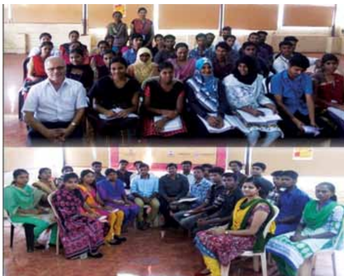
Students with course co-ordinators and trainers

• The PMKVY that started in Feb 2016 with 49 students in two batches for FTCP, successfully trained 39 students out of 49 students. These students who have passed (approx 80%) the final assessment, are waiting for the NSDC certificates and the cash rewards.