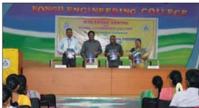
Release of the proceedings of the conference VESCOM 2016