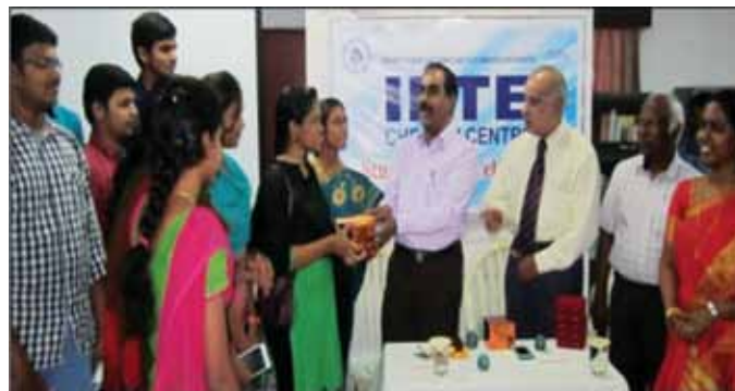
Present Centre Chairman and Immdt Past Chairman, talking to the students on the day