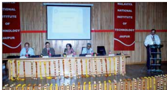
IETE Zonal Seminar-North on “ICT in Healthcare” in progress