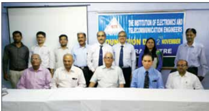
Members commemorating, IETE Foundation Day at Vadodara Centre