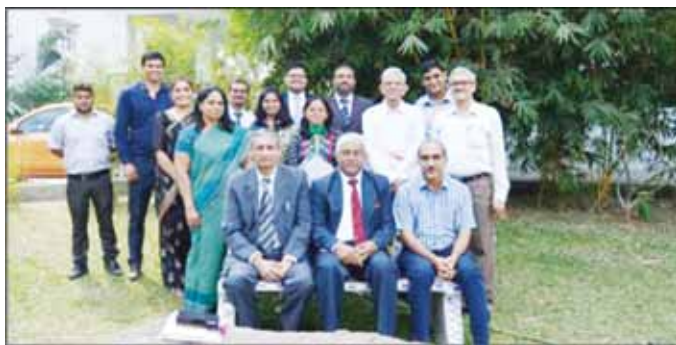
Dignitaries with IETE Members at PAC, Sarigam

The Apex Forum had detailed discussions on different aspects such as: 5G Vision, 5G characterization, licensed & unlicensed spectrum, 5G and its requirements, bandwidth management techniques, challenges due to upcoming services like Internet of Things, visible light communication, intelligent transportation system, etc.