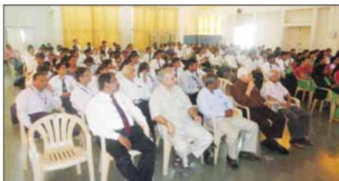
Audience at Pune listening with rapt attention