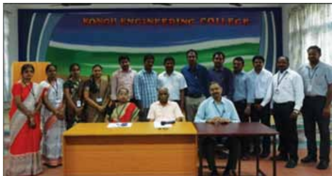
A group of ISF Co-coordinators present during the meeting