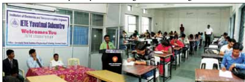
IETE Students’ Day Celebration